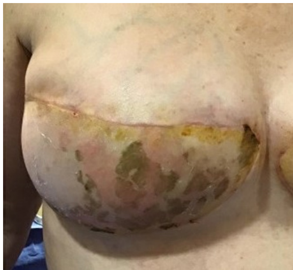
Figure 2 Following 10 hyperbaric oxygen therapy treatments of compromised superior gluteal artery perforator flap with improved echymosis.

over 90 min with no breaks to 2.5 atmospheres over 90 min with two 10 min breaks allowed. The patient underwent a total of 29 HBOT sessions without complications.