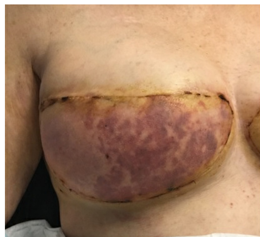
Figure 1 Postoperative day 12 of superior gluteal artery perforator flap reconstruction presenting for her hyperbaric oxygen therapy treatment. The figure demonstrates significant ecchymosis concerning for compromise of the flap.

Patient subsequently underwent a HBOT regime of five times per week ranging from 2.0 atmospheres